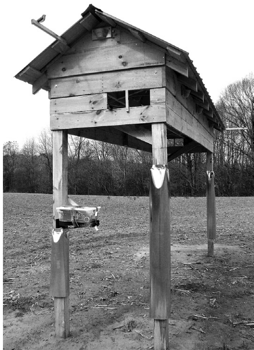
FIGURE 1. One of the nesting structures built to test the impact of conspecific cues on prospecting and nesting by Barn Swallows ( Hirundo rustica erythrogaster ) in southern Ontario, Canada.

structures with similar characteristics to bridges and barns that are used for nesting, including rough vertical surfaces on which birds can build nests, shelter from wind and rain, visual barriers between nests, and a structure large enough to support several nesting pairs (MECP 2013; L. Sarris pers. comm. 13 February 2014; K.R. unpubl. data). We designed a wooden structure with a metal roof, 4.9 m long, 1.3 m wide at the nesting compartments, and 3.7 m tall at the peak of the roof (Figure 1). The structure included 16 nesting compartments, two rows of eight compartments along the 4.9-m length of the structure. In each row of eight compartments, we alternated available nest supports by providing a wooden nest cup (i.e., a wooden replica of a nest) in one compartment and bridging in the shape of the letter X, as found in some old barns, in the next compartment. Each compartment was bordered by 5 × 25 cm lumber along the center and along the outside of the structure and 5 × 15 cm lumber between compartments on the inside of the structure to provide a visual barrier between nests. Compartments had a flat ceiling above and no obstructions below. To provide shelter from weather, we added 40 cm of lumber along the outside of the structure below the nesting compartments.